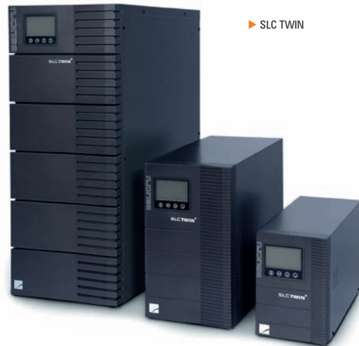
► SLC TWIN