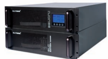
► SLC TWIN RACK 19"